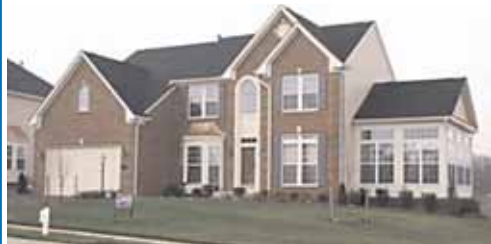
Archers Rock - $566,000

4 Bedroom, 2 ½ Bath home located in desirable Honeywood riverside community. Home sits on 2+ acres on cul-de-sac. Luxurious Master Bath with clawfoot tub. Family room with exposed beams. Formal living & dining rooms. Oversized kitchen. Community has access to Potomac River for deep water boating. BE6292709