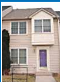
Spring Mills - $165,900

This affordable home would be great for the first time home buyer, or even better as an investment. Property includes 2 city lots, great for future development. Home has new paint, carpet & wood flooring. Seller offering $1,000 appliance allowance. BE6402905