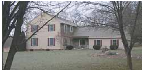
Honeywood - $419,900

4 Bedroom, 2 ½ Bath home located in desirable Honeywood riverside community. Home sits on 2+ acres on cul-de-sac. Luxurious Master Bath with clawfoot tub. Family room with exposed beams. Formal living & dining rooms. Oversized kitchen. Community has access to Potomac River for deep water boating. BE6292709