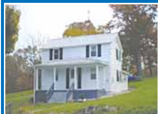
Hedgesville - $159,900

rooms. Eat-in kitchen. Separate laundry on bedroom level, large deck off kitchen & a finished lower level. All appliances included. BE6332331